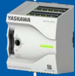
MICRO PROFINET I-Device