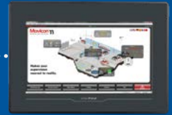
Visualisation / WebVisu