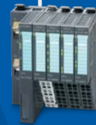
MICRO PROFINET IO-Controller